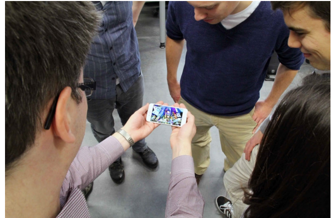
Figure 1. A group of people is simultaneously trying to look at a picture which causes a bad viewing experience.

Nowadays mobile devices are ubiquitous devices that contain advanced technology, such as cameras. Through the proliferation of digital cameras and cameras built into phones, more and more digital content is being produced. Hence, persons often find themselves in a situation where a digital picture or video has to be shared but the screen space is just too limited. Especially when showing digital content to several persons, the limited screen space results in a bad viewing experience for the viewers (see Figure 1). To solve this problem, Schönig et al. [16] suggested to extend mobile phones