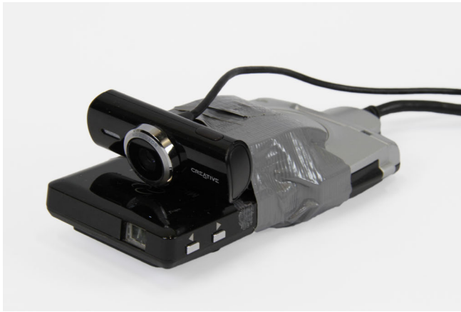
Figure 3. Prototype containing pico projector and simple web cam.

edges. The results indicate that surfaces with holes are perceived worse than flat surfaces for projecting content. These differences are significant for white and black surfaces. Additionally, the study indicates that surfaces containing edges are always perceived worse than flat surfaces and surfaces with holes. This trend is significant for white surfaces.